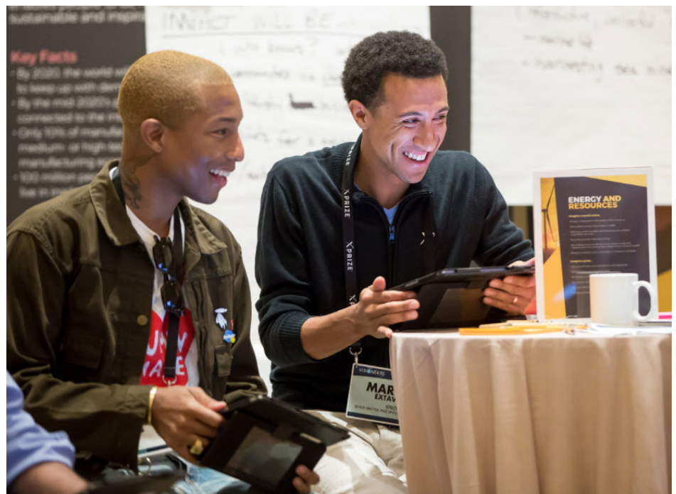
XPRIZE Mentor Pharrell Williams (left) using Swarm

Unfortunately, humans haven't yet evolved the natural ability to form a swarm intelligence. That's where Swarm AI technology comes in.