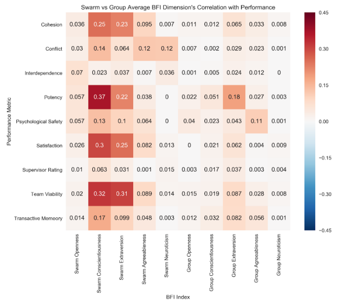
Fig. 2. Heat map of Pearson R 2 values between Swarm or Survey Average Personality Measurement and Performance Metrics

The R 2 values for each personality measurement method are shown in Appendix A, and the Survey Average vs Swarm Correlations with the performance metrics are shown in figure 2 below. Immediately, these plots show that, on average, swarm-based assessments of group personality have a higher correlation with team performance than the survey-based assessments of group personality.